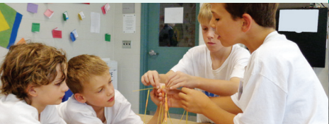
Engineering & Science