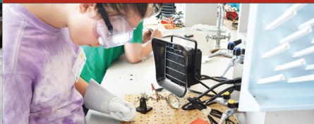
Computers & Technology