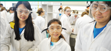
Yes SHE Can!